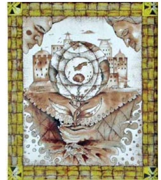
© 2007 Original Artwork: 'Culture and the City' by Iliesha Maikeli

The Competition promotes art as a valuable way of developing a language of exchange that can be used to promote reflection and advance dialogue among different stakeholders. It also acknowledges the important role art can play in enhancing urban vitality and sustainable development. Participating in the art competition gives individuals and groups the opportunity to reflect on how they use their own city or town environments and what they can do to get involved with their local council to help realise their own urban futures.