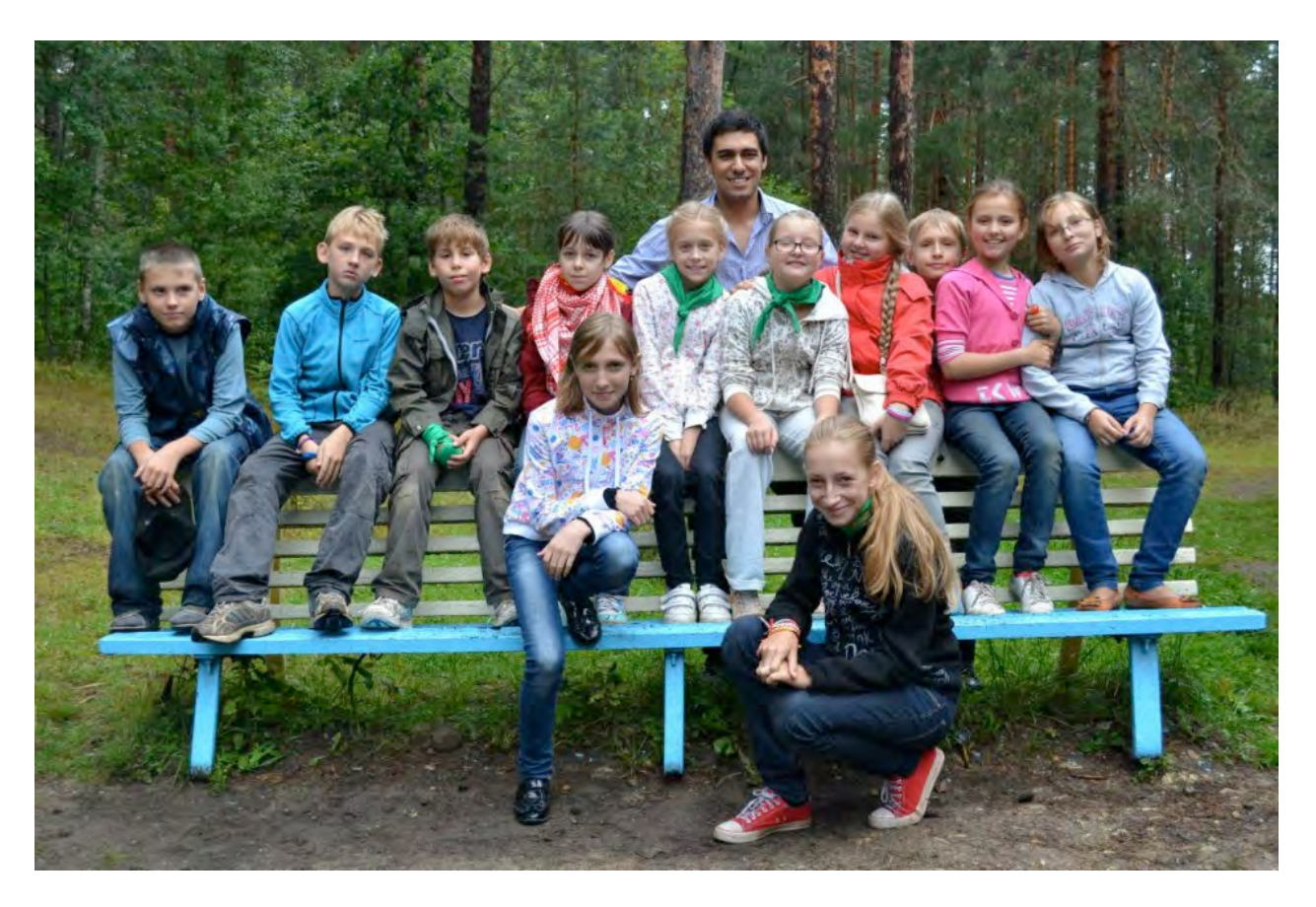
ORANGE LANGUAGE CENTRE CAMP, LUGA, RUSSIA