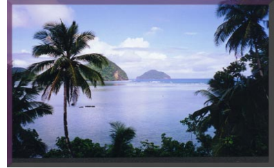
SOLRORO A VIEWED FROM AHAUSI