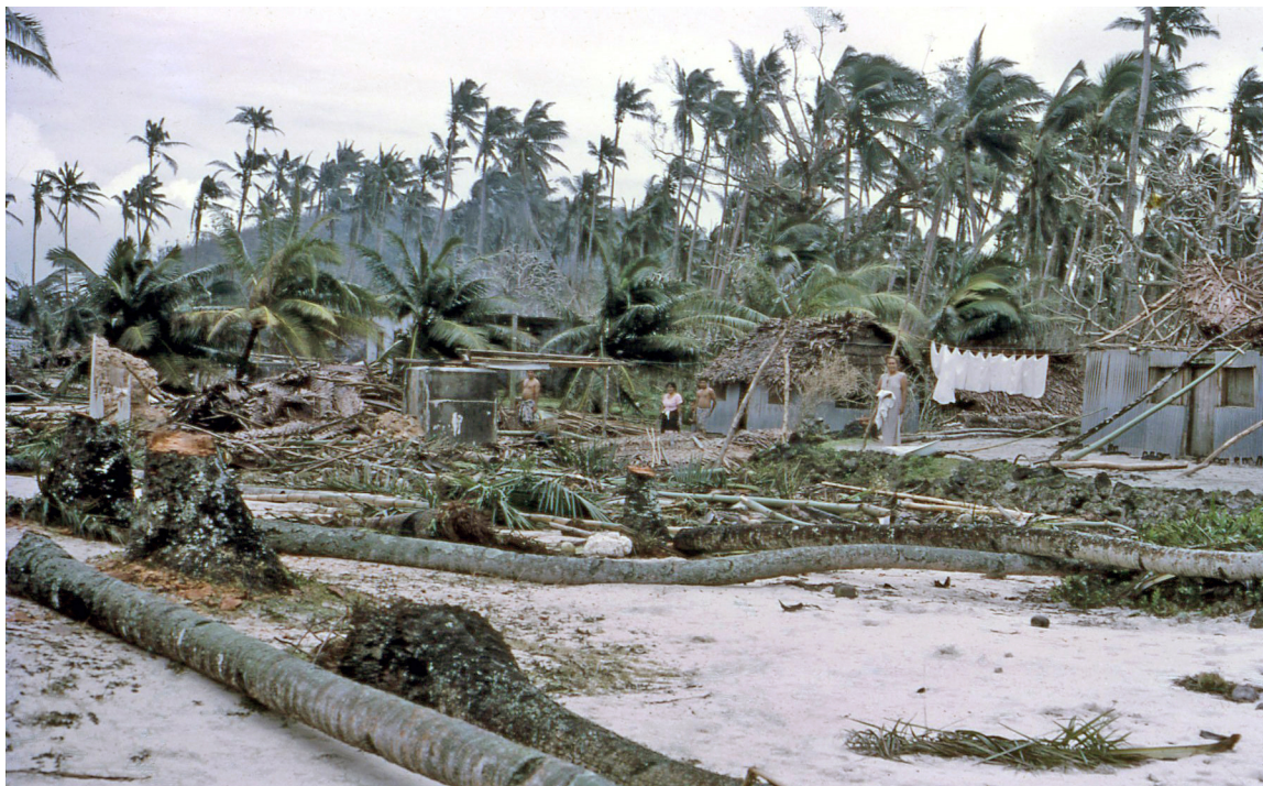
Devastation from Hurricane Bebe (Rotuma, 1972).

volunteer from September 1989 until December 1991. He contributed a set of 19 miscellaneous photos for uploading.