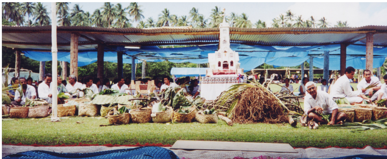
Panoramic photo of food presentation at 150th anniversary of Catholic mission, showing cake in the shape of the Sumi Mission Church (Rotuma, 1996).

widely dispersed Rotuman community, and early in the 21st century we decided to write a history of the Rotuman people.