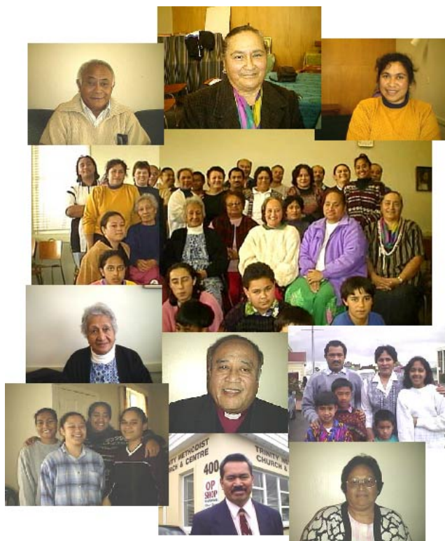
Photo montage of Rotumans in Auckland (1998).