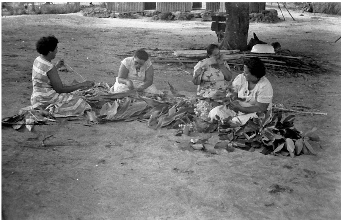
Women preparing pandanus leaves prior to weaving mats (Rotuma, 1960).