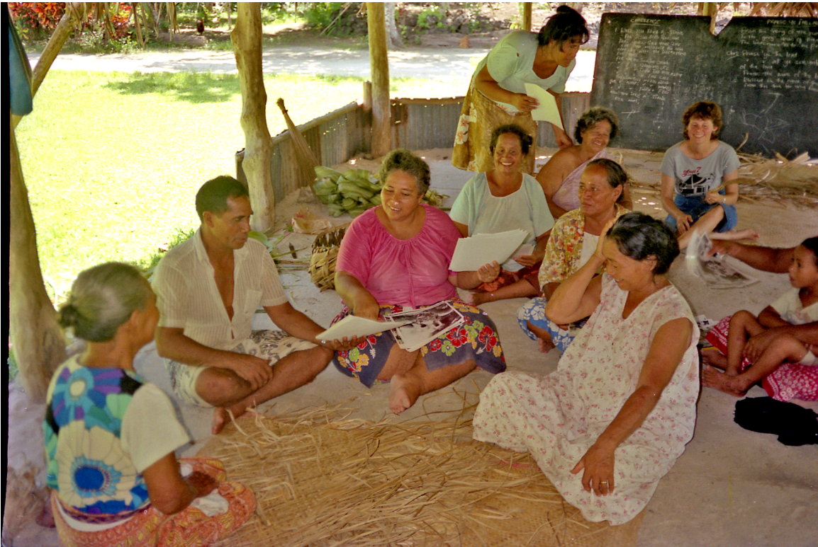
People in Itu'muta District looking at photos from 1960 (Rotuma, 1987).

During our 1987 visit we took color photos only, mostly as a record of our experiences there, but in our three visits to Rotuma in 1988, 1989, and 1990, during which time Jan was doing dissertation research, we had a more ethnographic focus in mind. For that period we took two cameras along, one for slides, the other for color prints. We accumulated a total of 314 slides that we categorized as follows: houses (47), boat days (14), visit of the Fairstar tourist ship in 1989 (31), environmental problems (20), work (17), weddings (19), social life (20), food production (20), ceremonies ( kato'aga ) (28), other events (14), activities of women & children (14), friends (19), children in school (31), and Jan & Alan (20). The slides were supplemented by color prints (uncategorized) of people, events, and scenery.