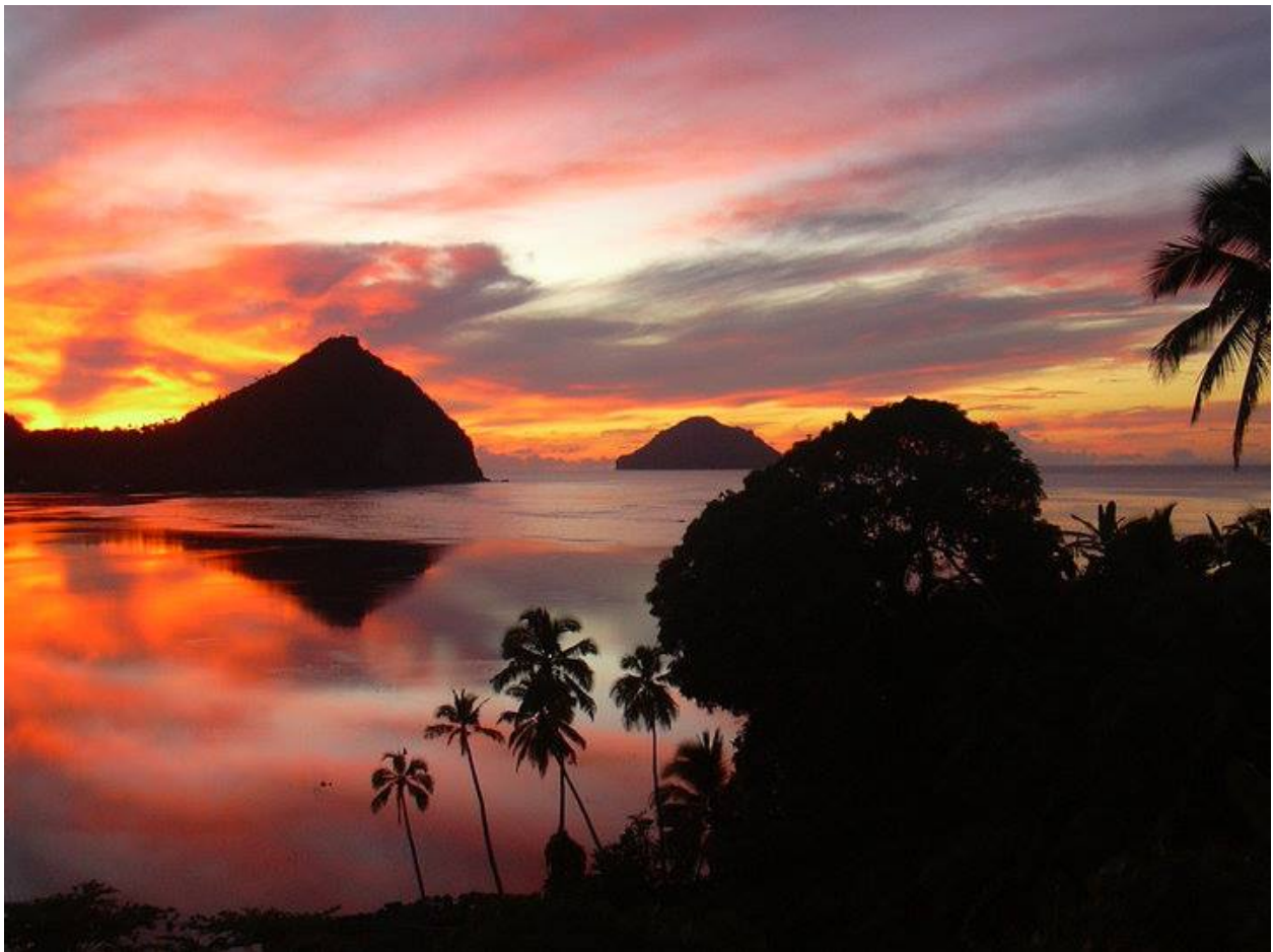
View across Maka Bay at sunset (Rotuma, 2010).

Another category of photos are those recording events, some of which are considered to be of particular historical value—for example, the opening of the council house in 1971, the devastation caused by Hurricane Bebe in 1972 (see above), the 100th anniversary celebration of cession to Britain in 1981, and the 150th anniversary celebrations of the first arrival of Methodist and Catholic missionaries in 1989 and 1996, respectively. Such photos seem to be less highly valued by most Rotumans unless they include images of kinsmen or close friends, or in some instances, buildings or places of special interest (e.g., one's home that had been damaged in Hurricane Bebe). An exception to this are occasional booklets printed by Rotumans to commemorate historical events such as the anniversaries of missionary arrivals.