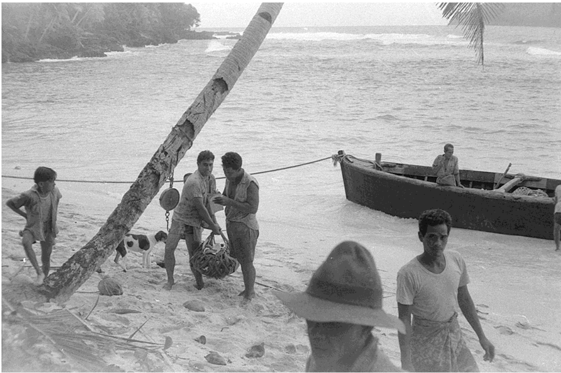
Men weighing copra on beach prior to drying it (Rotuma, 1960).