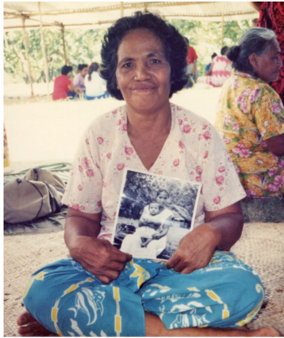
Woman with photo of self from 27 years earlier (Rotuma, 1987).

The photos and slides were taken to provide visual reminders of our experiences on the island, as supplements to our field notes, and as potential illustrations for publications and lectures. At times, Rotumans specifically requested or instructed us to take particular photos, especially at ceremonial events. Interestingly, they never asked for copies of the photos; they just wanted to be sure we were photographing the things that were important from their point of view.