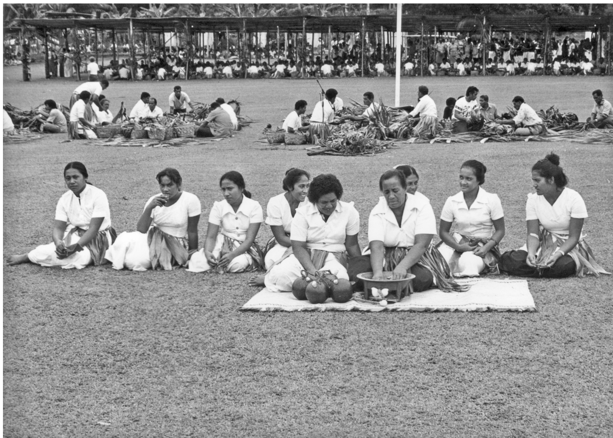
Centennial celebration of Rotuma's cession (1981).